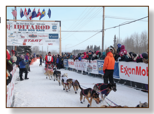
Host hotel for the Iditarod 2003, 2015, 2017

Aveda® aromatherapy bath products, free wireless Internet, in-room coffee/tea service, hairdryers, make-up mirrors, free business center, 24-hour gift shop with snacks